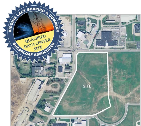
Aerial view of lot layout