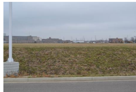
View from south center looking north