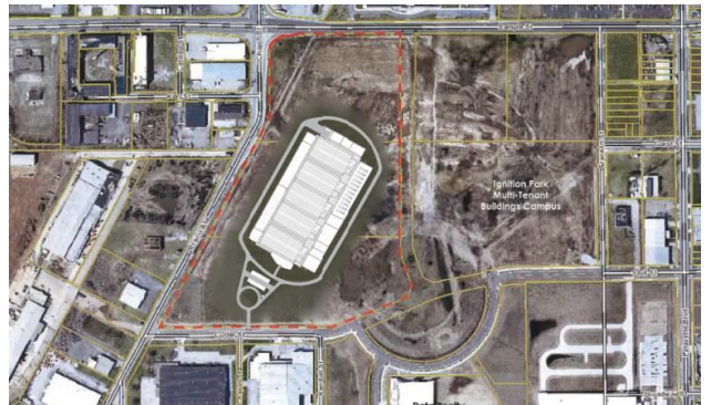
View of 100,000 square foot data center on site

*subject to qualifications and availability