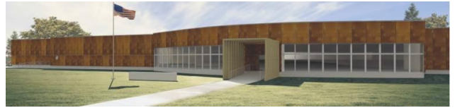
Rendering of data center at site