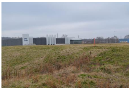
View from east corner looking southwest

*subject to qualifications and availability